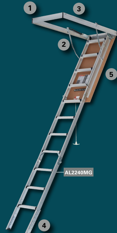
AL2240MG FLYER 2023 © Louisville Ladder, Inc. All rights reserved.