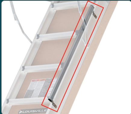
5 Safety Aluminum handrail for a comfortable transition.