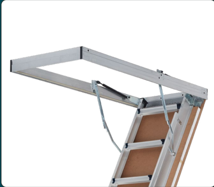
1 Lighter Aluminum Frame Pre-drilled holes for easier installation.